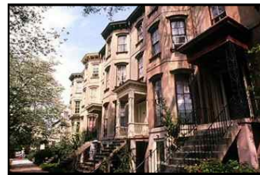
Historic Savannah, GA

2011's DEEP SOUTH TRIP WAS FULL AND FANTASTIC!! BUT THERE'S STILL LOTS OF ROOM FOR 2012.